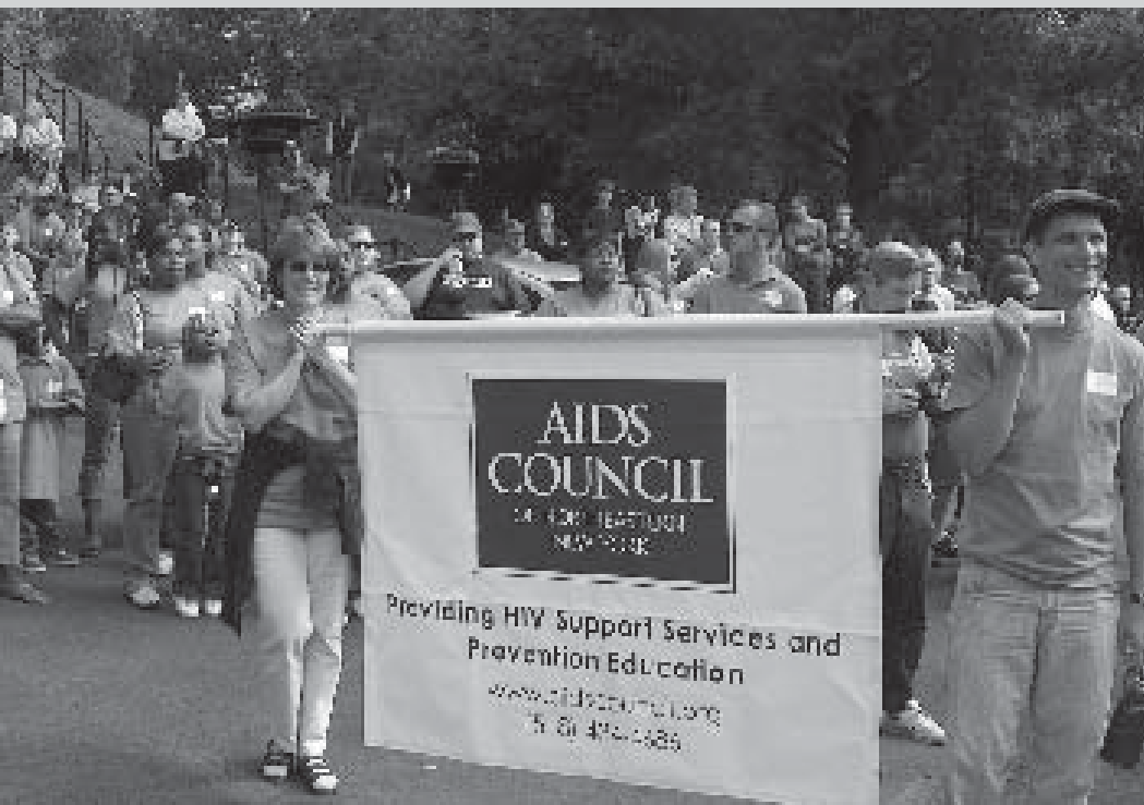
✓ Patrons support Dining Out for Life® 2007