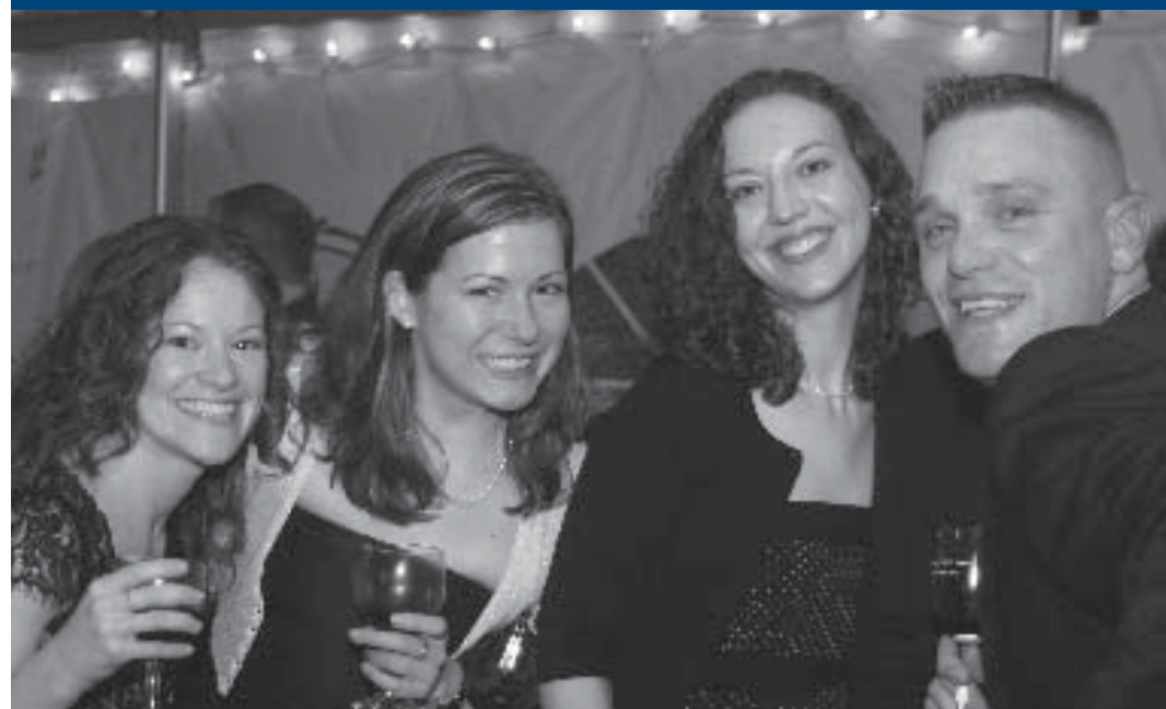
Party goers enjoy the festivities at 2006 Beaujolais Nouveau Wine Celebration

* AIDS Council of Northeastern New York's fiscal year runs from July 1 to June 30. The financial information that is presented here was extracted from the June 30, 2007 audited financial statements, which were audited by Wojeski & Company, CPAs, P.C., who issued an unqualified opinion on the financial statements. For a complete copy of the June 30, 2007 audited financial statements, please contact us at 518.434.4686.