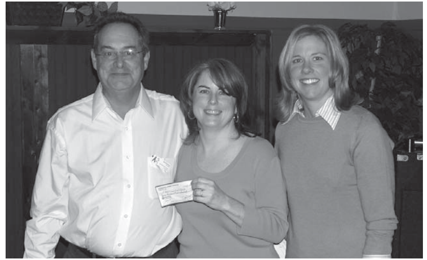
^ The AIDS Council accepts a generous donation from Our Brothers' Keepers Foundation